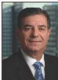
Mayor Michael Pavia

Stand side by side with Stamford Mayor Michael Pavia and WABC-TV's Bill Evans in our most visible display to promote breast cancer awareness. Support local breast cancer survivors as we line the streets and literally "Paint the Town Pink."